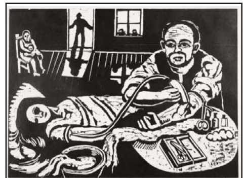
Title: "Then" Woodcut on handmade Houshoshi paper - 21x30"

Results from a number of important clinical trials of new antiretroviral drugs were presented at CROI 2007 and offer hope for patients infected with multidrug resistant HIV. We report on two new antiretroviral agents that are relatively advanced in their clinical development, are currently available via expanded access programs, and may be of immediate clinical interest. These drugs represent two novel antiretroviral classes and have the potential to positively impact treatment outcomes as well as change the prevailing